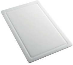
HDPE Chopping board 8657 001